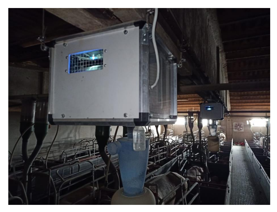
Figure 1. Prototype of the equipment with Cyclonic system. Airflow:100 m<sup>3</sup>/h.

During a 73 days period, the reduction of the aforementioned contaminants was assessed in the maternity room of the farm, where two purification/disinfection equipment with a cyclone filter (purified room) were installed.