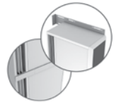
Joining kit SPJ-KOOL (Galv. / SS)