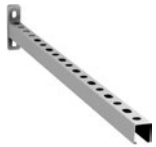
Wall rail support SPWR