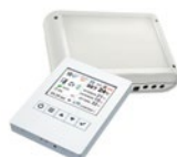
Clever Control Kit